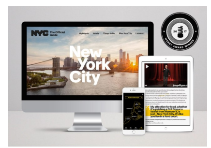
NYC & Company, NYC official destination marketing organization won the 2017 Webby for Best Travel Website.

Source: bellweather.agency/nyc-city-branding/