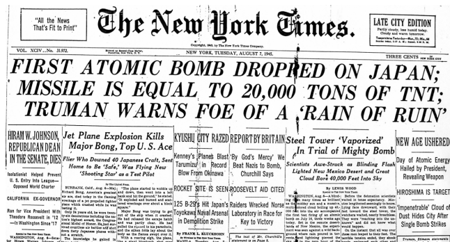
Hiroshima, The New York Times, 7 August 1945

President Truman's radio address to the American people after the signing of Japan's unconditional surrender, September 1, 1945.