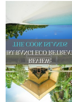
The Cook Islands, the first eco destination in the Pacific. Photos, Louise Southerden, Traveller , October 1, 2018.

Pacific developing small islands share a number of unique characteristics hindering economic growth. These include their small size and fragmentation, ranging from four inhabited islands to more than 300, and an high vulnerability to global environmental challenges, most notably climate change. The challenges may seem daunting, but to preserve the environment, reverse ecological destruction and provide decent livelihoods, these states need to take a greener and more inclusive approach to development. "Challenges for Developing Small Islands", John Vidal, The Guardian , 3 March 2017.