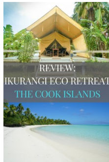
The Cook Islands, the first eco destination in the Pacific.