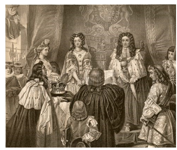
The Crown offered to William and Mary by the Lords and Commons at Whitehall, February 13, 1689, Anonymous engraving.

Declaration of the Prince of Orange, The Hague, October 10, 1688.