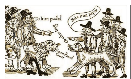
Royal supporters versus Parliament supporters. Engraving, anonymous, circa 1646.

I shall begin first with my innocency. [...] I call God to witnesse, to whom I must shortly make an account, that I never did intend to encroach upon the rights of the two Houses of Parliament, [...] they began these unhappy troubles not I. So I hope that God will clear me of the guilt of these crimes laid against me.